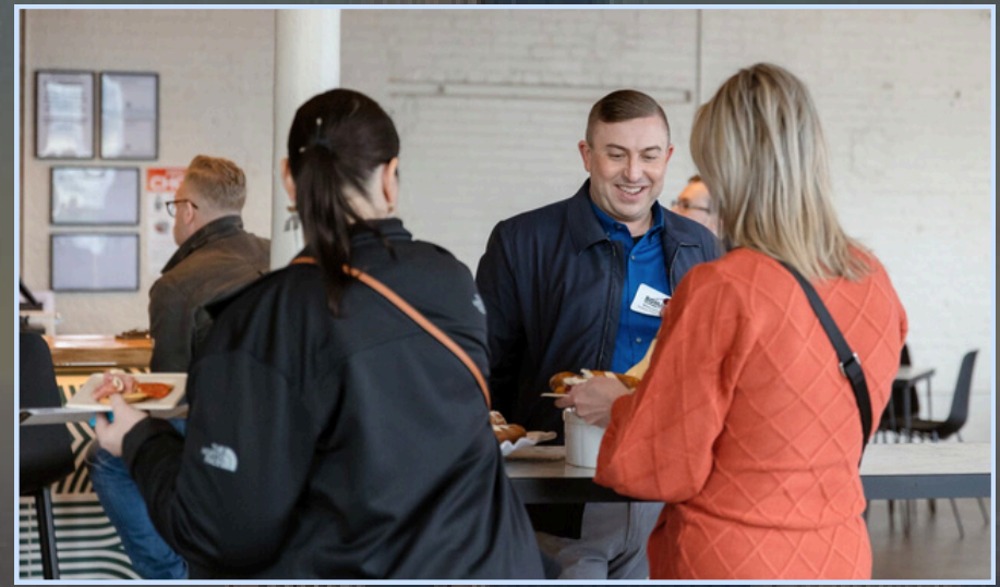
Barcalo Buffalo Living Tour

Established in 1921, our mission is to actively represent the best interests of the commercial real estate owner, the real estate professional, and industry service providers through effective leadership in advocacy, the collection and dissemination of information, and the professional development and accreditation of the real estate professional.