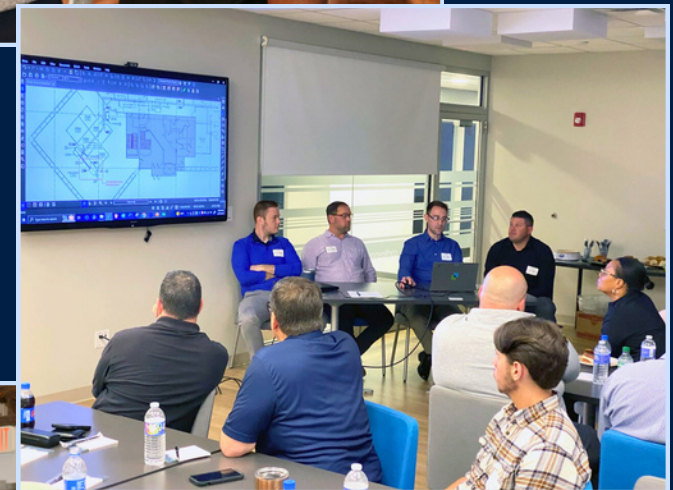
Blueprint Reading Seminar

Support educational programs including professional designation tracks that will enable each member to be a more effective and valuable manager.